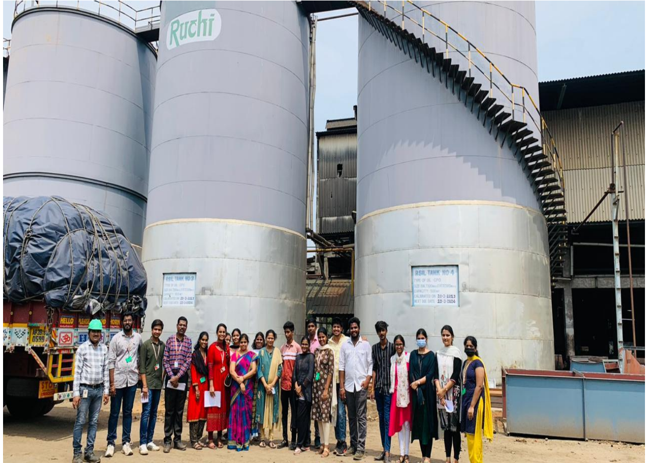
Picks of Industrial Visit