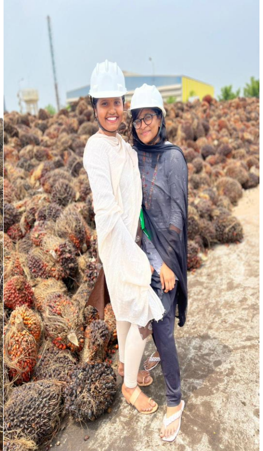
Picks of Industrial Visit