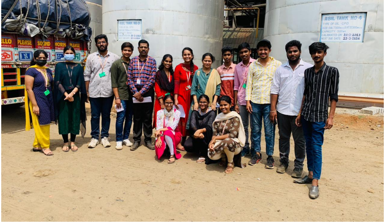
Picks of Industrial Visit