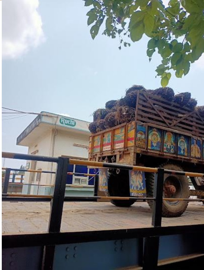
Picks of Industrial Visit